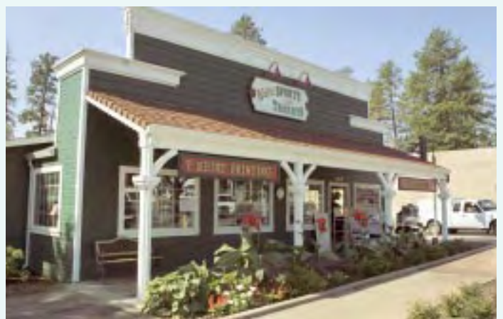
► If Measure O passes, our investment in revitalizing downtown will be wasted.

We made a smart choice to redevelop our downtown business area, and now it's starting to pay off. Locally owned businesses are improving and the center of our town is rejuvenating. But independent studies show the proposed mall will drain $24 million each year from locally owned businesses, forcing many into bankruptcy and wasting the millions of tax dollars we're investing downtown.