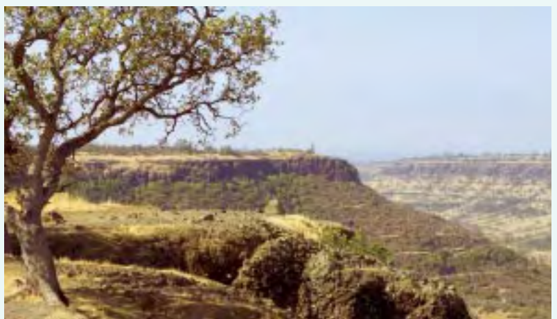
► If Measure O passes, the new mall will greet visitors to our town instead of breathtaking scenery.

We're a generous town that welcomes new businesses, residents and visitors. Everyone should be lucky enough to have a piece of Paradise—but only if they don't ruin it for the rest of us. The facts are in about Measure O and the choice is clear: Give Measure O the boot!