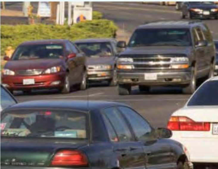
► If Measure O passes, the new mall will generate thousands of additional car trips each day on our local roads.