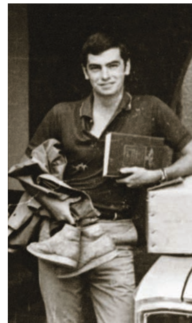
Senator Dodd in the Peace Corps in the Dominican Republic

While serving in the Peace Corps, Chris Dodd saw what the world could achieve when America leads with its highest ideals – justice, opportunity and hope. Now, in these demanding and dangerous times, the world needs America to lead once again and answer the call to service.