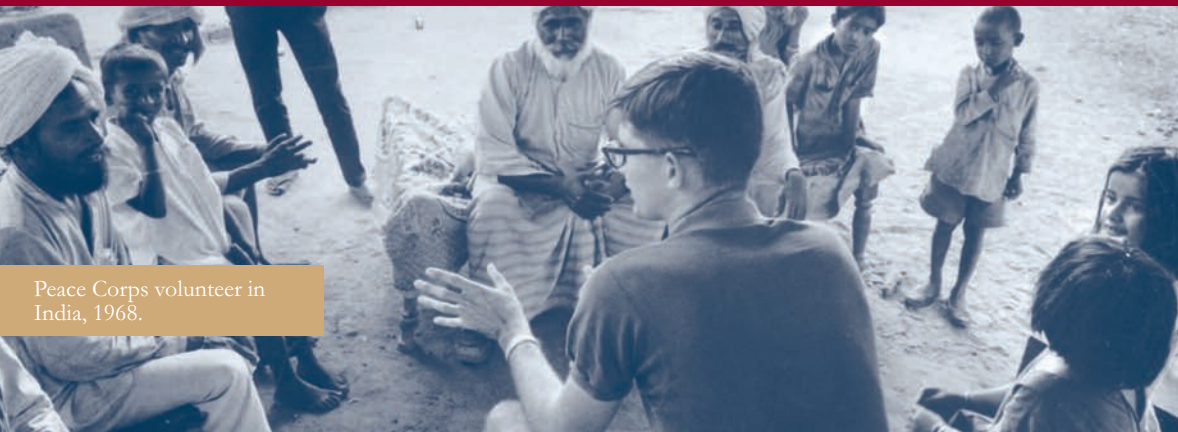
Peace Corps volunteer in India, 1968.